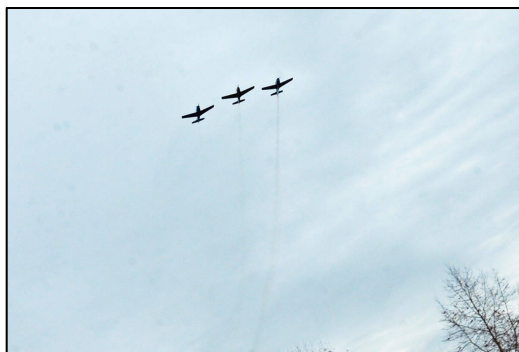
Remembrance Day Fly Over Aldergrove, November 11, 2020

Hasn't our world changed in 9 months? As I watched the fly over for Remembrance Day out our front door, I realized that this is the first Remembrance Day service I've missed in well over 60 years. The thread of analogy between war and the pandemic is not hard to find; both change our culture substantially.